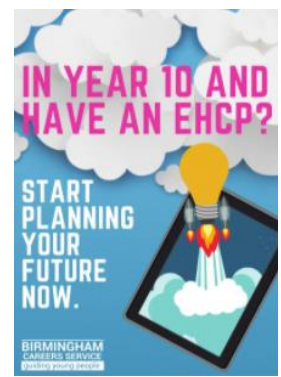
Year 10 with an EHCP