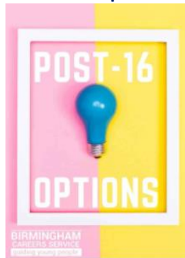
Post 16 Options