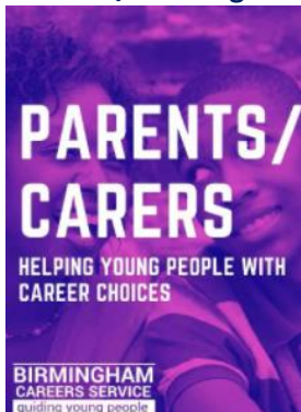
Parents / Carers guide