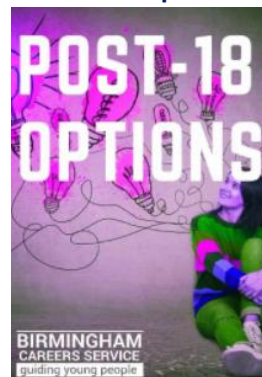
Post 18 Options