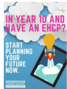
Year 10 with an EHCP