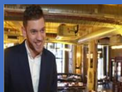
What skills do you need to work in a restaurant?

Here's a selection of topics BBC Bitesize has in its Careers section so why not take a look?