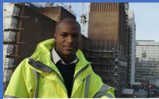
Explore careers by job sectors