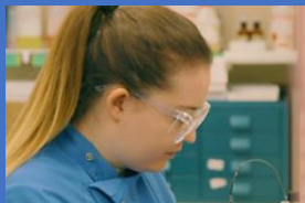
Where could your favourite subject take you?